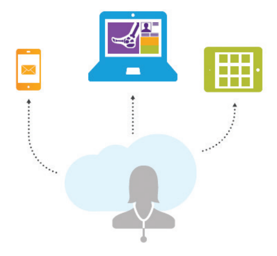
Figure 2: Providing seamless access to mission-critical and life-critical applications

Secure, mobile healthcare workflows are made possible by a number of features built into the XenApp and XenDesktop solution. A summary of these features and capabilities follows.